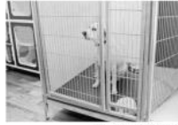
Cotton the dog tests out a dog pen on Wednesday at Family Promise of Montgomery. Family Promise is a shelter for homeless families, which now takes families with pets.

Each "gift" will be a financial contribution supporting a specific need of the organization. For example, a shopper might honor her "food-loving friend" by giving a week's worth of hot meals to an elderly couple in need. Or a construction business might honor its clients by helping a building-related nonprofit buy building supplies.